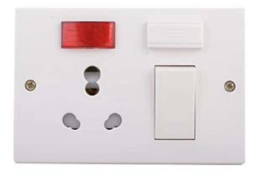
Fig : AC Power Socket with Switch, Indicator and Fuse