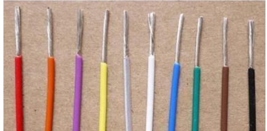
Fig : Electrical PTFE Wires

PTFE is resistant to lubricants and fuels, very flexible, and it has excellent thermal and electrical properties.