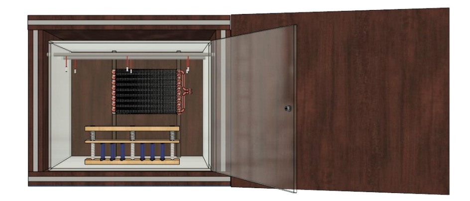
Fig: Acrylic Hinged, Front-Load Cell Test Chamber Drawing

Cell Test Chamber is made of Acrylic which offers 360° visibilities during testing. It is Front-loading and has Hinged lid, which is ideal for product testing applications