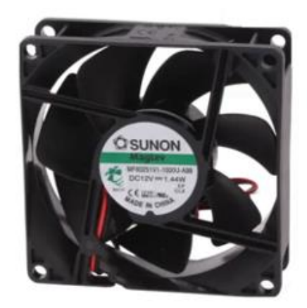
Fig : Sunon 8025 12VDC 1.44W Cooling Fan

A 12V, 1.44W BLDC Motor fan is used to provide Forced Air cooling to the Data Acquisition Unit to prevent its malfunction or damage due to overheating during operation.