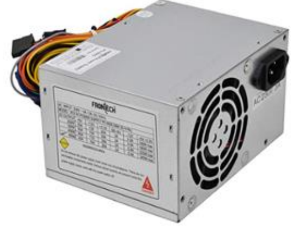
Fig.: Frontech PS-0005 230V/450W SMPS

The 450W SMPS unit of make - Frontech, is used to fulfil power requirements of various components used in the cell test bed experiments