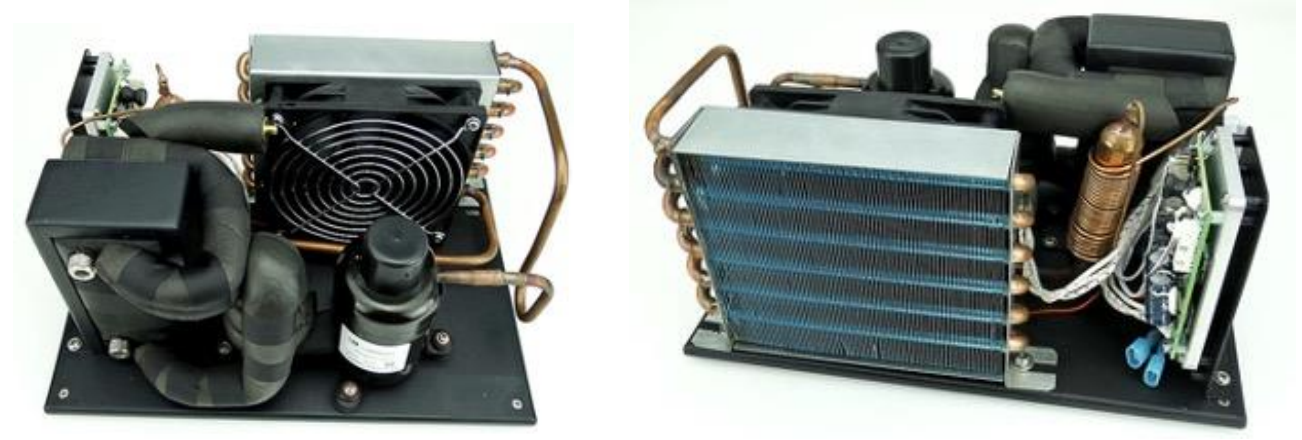
Fig.: DC Mini Refrigeration Module

A mini refrigeration module is used to achieve sub-zero temperatures inside the cell test chamber. It consists of Evaporator, Condenser, Capillary Tube and Compressor as its main components. The evaporator is fixed in the side walls of the Test Chamber. It is controlled by the microcontroller which gets its temperature feedback through the LM35 sensors used inside the chamber. The condensed water is collected by a grooved ramp on the side and drained out.